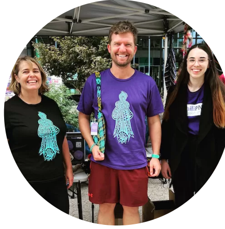
Canberra markets have been a great opportunity to meet new and existing supporters