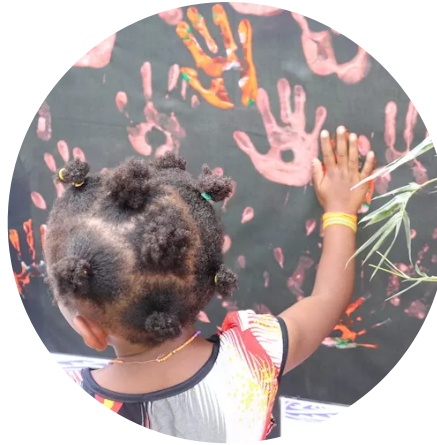
One of many children who participated in the 'stop violence' hand painting activities during 67th Goroka Show in Goroka, Eastern Highlands Province.