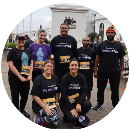
Some of our #RunForFemiliPNG team members at the Canberra Marathon

Thank you to everyone who continue to make our work possible!