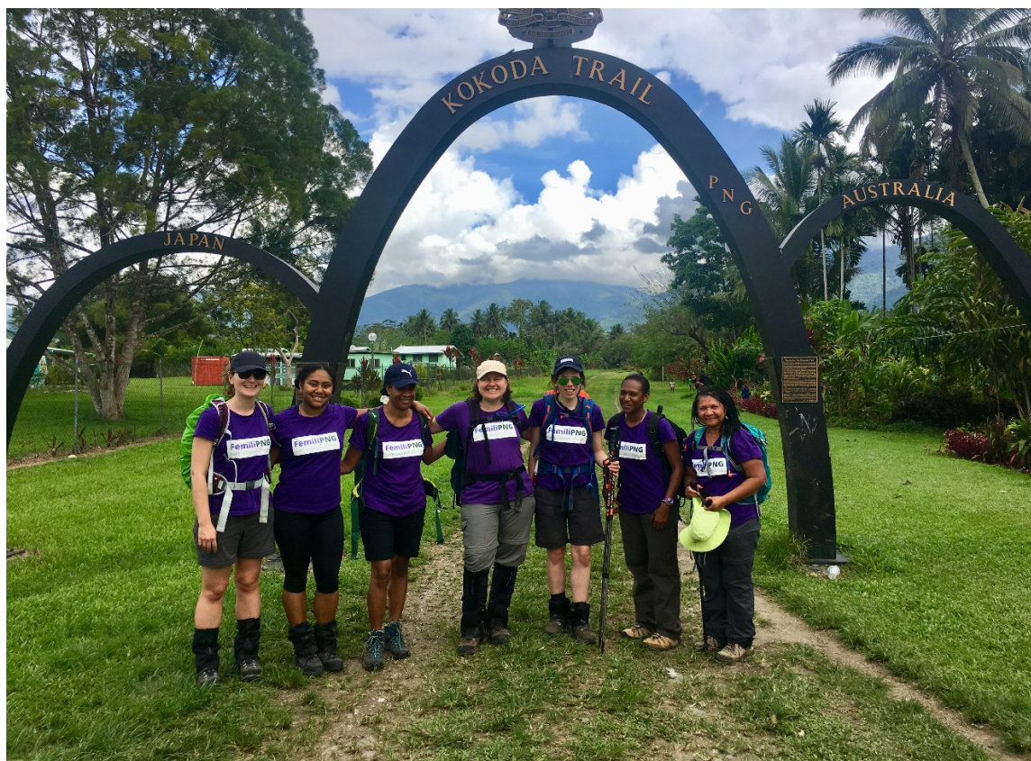
Above: The #Trek2Protect2018 team.

The #Trek2Protect2018 team members were from Port Moresby, Melbourne, Ballarat, Sydney and Canberra and collectively raised $36,372.