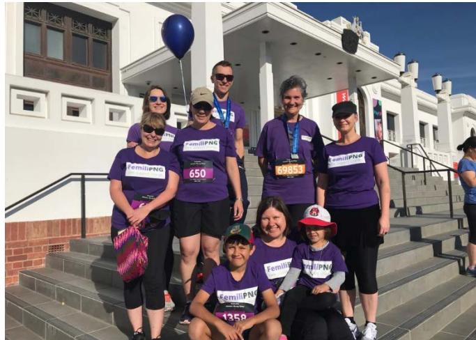
Above: Femili PNG supporters at the Australian Running Festival.

A record amount of $ 29,152 was raised which will go to support our programs in PNG.